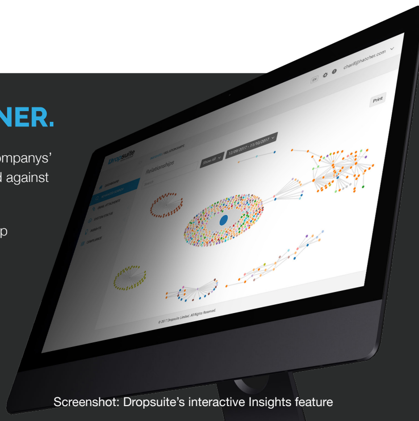
Screenshot: Dropsuite's interactive Insights feature

Gain Peace Of Mind: Threats to company data have never been higher. In the same way businesses insure their companies from liability, fire damage or theft — every business needs to be backing up their emails.